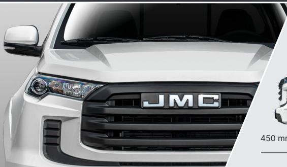
Robust Grille and Projector Type Headlamps

5 YEARS WARRANTY LIFETIME ENGINE WARRANTY