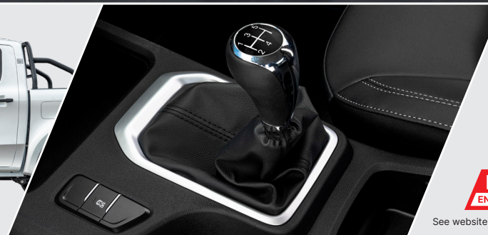
GETRAG 5-Speed Manual Transmission